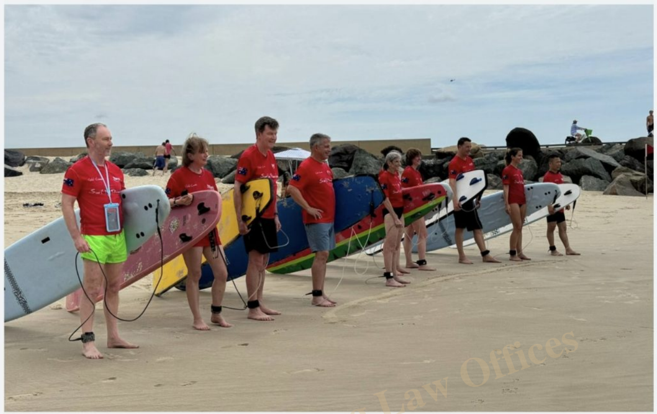
A Surfing Squad!