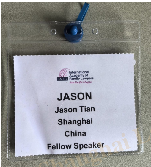
Badge at IAFL Brisbane Conference

It is always pleasant to be part of the IAFL AP chapter meeting, a chance to communicate, exchange ideas and have fun with peer family lawyers from other jurisdictions like Australia, Hong Kong, New Zealand, USA, Singapore, UK and even France.